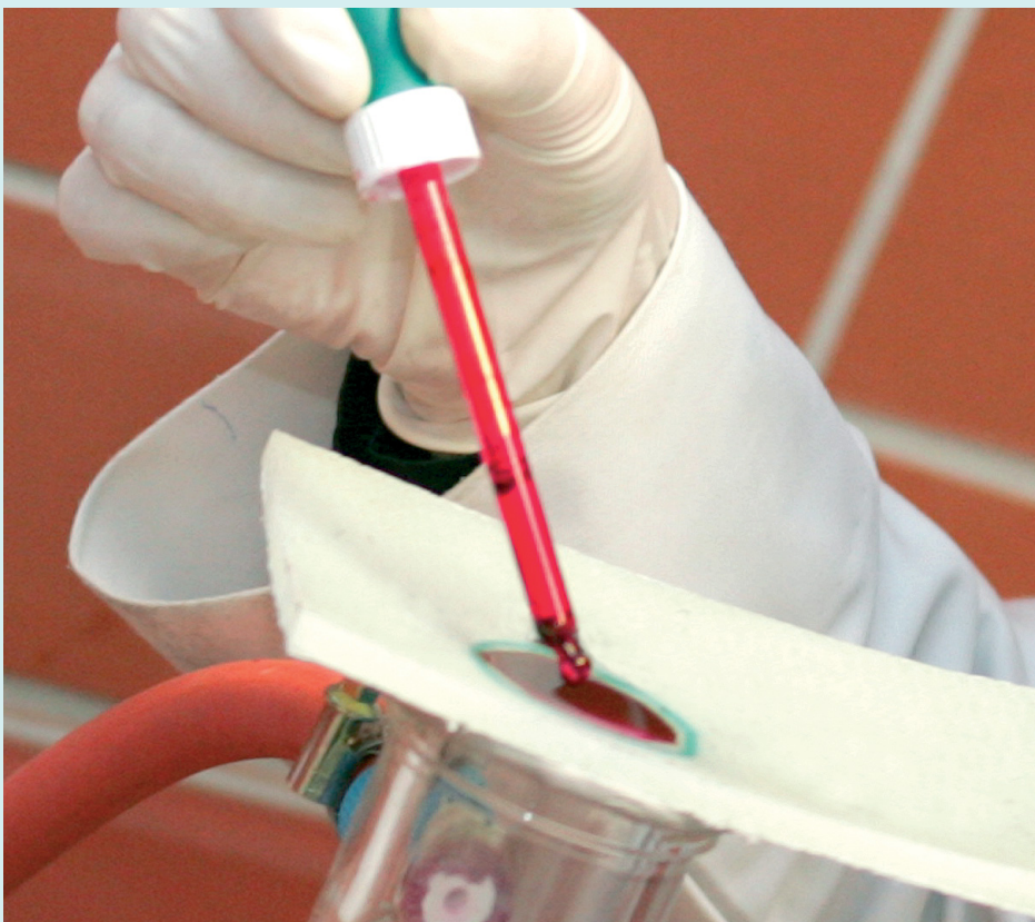
Testing of leak tightness

In general the IKT report confirms the findings of the IKT research project from the beginning of 2004: Tube liners (CIPP) are useful for rehabilitation as long as there are independent and neutral tests of site samples. There is a responsibility for clients who must make sure that liner samples are taken on site and sent to the laboratory with correctly completed paperwork. The choice of test institute must not be made by the rehabilitation company but has to be made by the client.